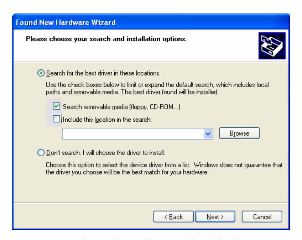
Select the upper item and browse your installation CD.

Please choose "Install from a list or specific location (Advanced)". Click "Next".